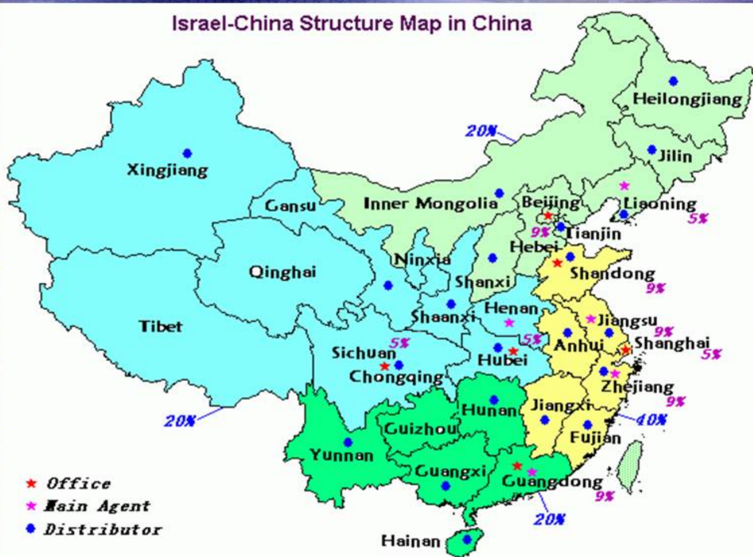
Israel-China Structure Map in China